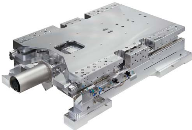
Wedged designed Z-axis for E-beam application.

State-of-the-art linear motion solutions could include advanced positioning and motion systems with the integration of linear bearings and profiled linear guideways. In addition, fabs worldwide are reaching for higher levels of performance with newer developments like these: